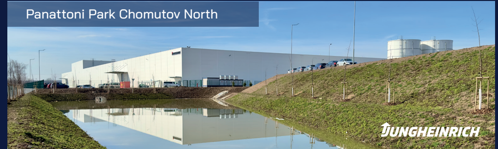
Panattoni Park Chomutov North