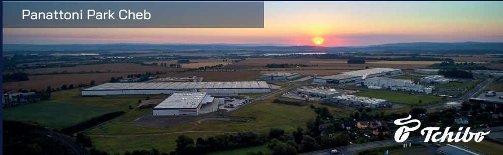
Panattoni Park Cheb