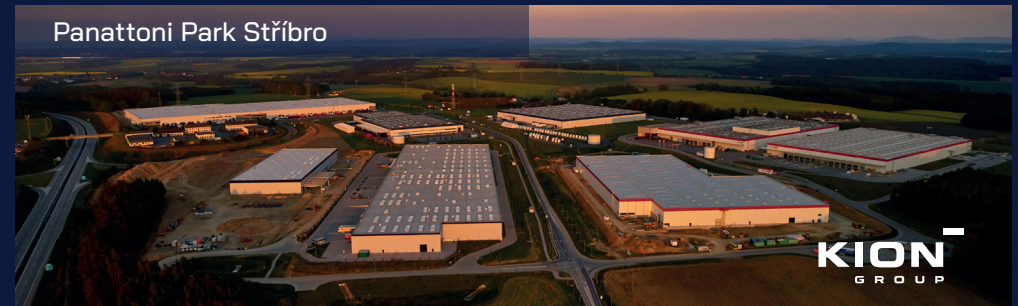
Panattoni Park Stříbro

Location: Ostrov u Stříbra, Pilsen Region